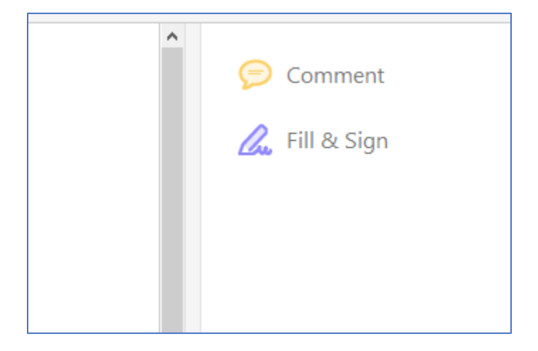
Open a PDF. On the right hand side, you will see options ot fill and sign:

If you don't see them, you can access them by clicking on Tools and then Fill & Sign: