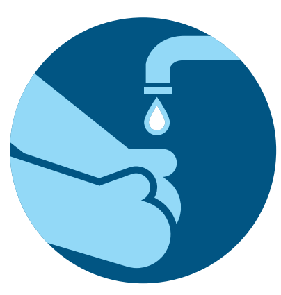
Wash hands often