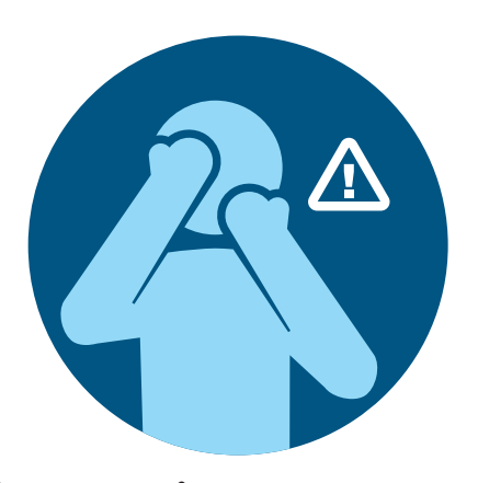
Avoid touching eyes, nose, or mouth with unwashed hands